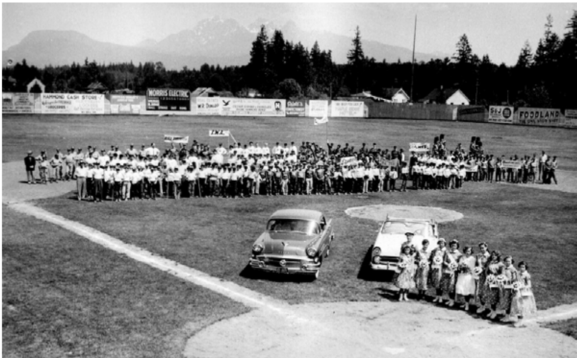
May Day celebrations disappeared after the Second World War and were replaced by the opening of the baseball season. Held usually on the 3rd weekend of May was the Pony League Parade and Tournament that kicked off the year. The youth teams – most sponsored by local businesses or community organizations – marched in parade from the Aggie Grounds in Haney to the ball park in Hammond, where this picture was taken in 1956