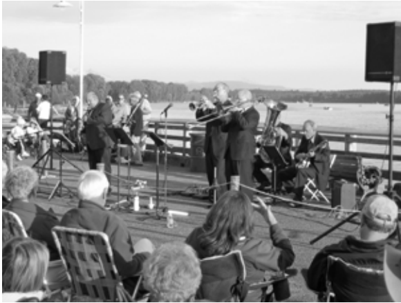
Creole Jazz Band – This group played our final concert in 2010.