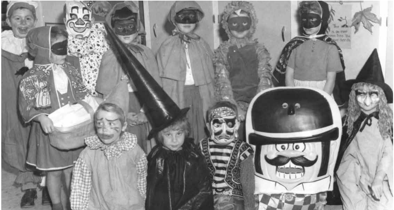
Primary school classroom dressed in costume for Halloween (1950s)