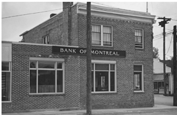
The Bank of Montreal on Lougheed in the 1940s.