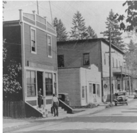
Looking east on River Road before the 1932 fire. Bank of Montreal building (left) was spared but the other buildings burned down.

The postmaster, Mrs. Storey (formerly Mrs. Charlton), built the post office in 1933, after a “fierce blaze” in November 1932 destroyed the buildings at the northwest corner of River Road and Ontario Street including the former Pacific Berry Grower’s building, the post office, and C.P.R. station and freight shed across River Road. The old Bank of Montreal building miraculously survived the fire, but what stood east of it was all gone.