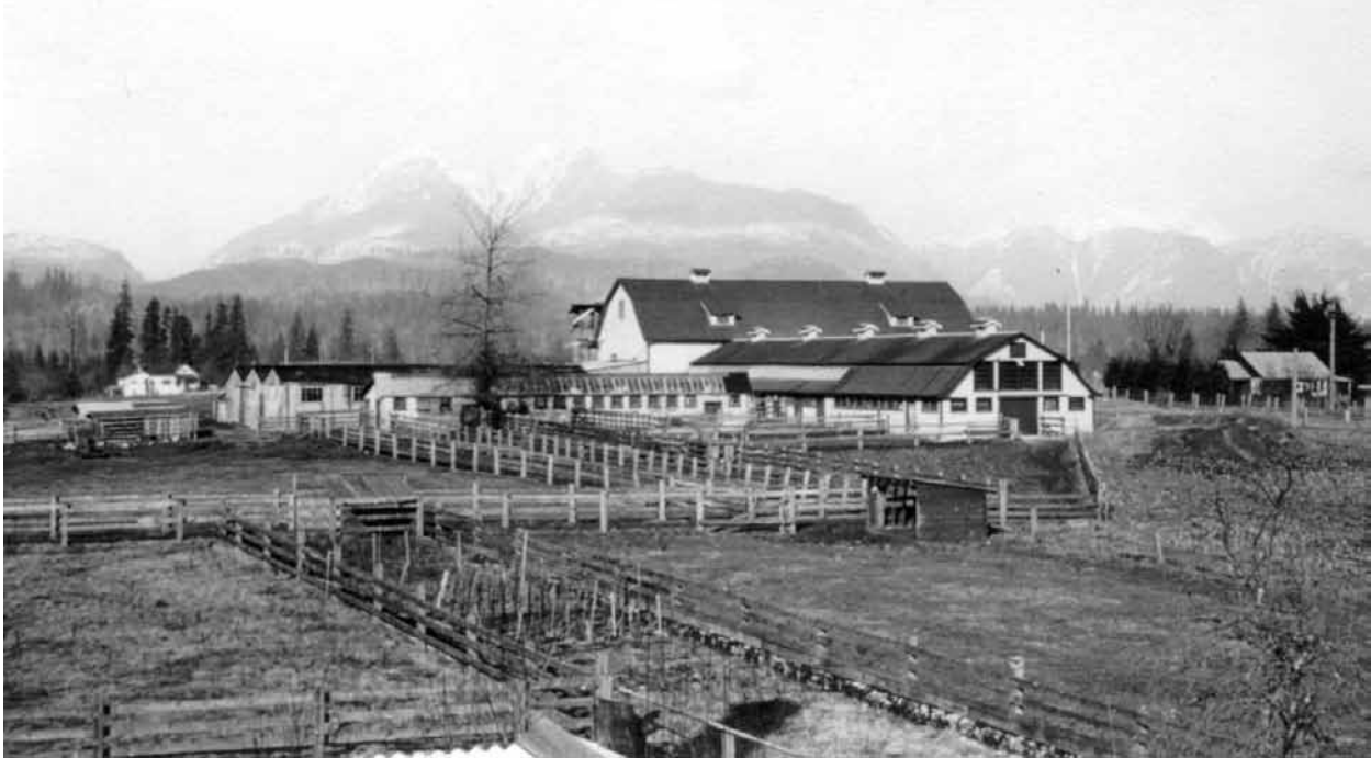
A view of the whole Spencer farm as it looked when purchased by the municipality in the late 1950s.