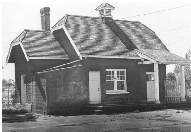
The Spencer milkhouse