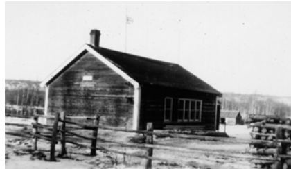
Photo: Arras School, British Columbia Peace River Country, built in 1931.